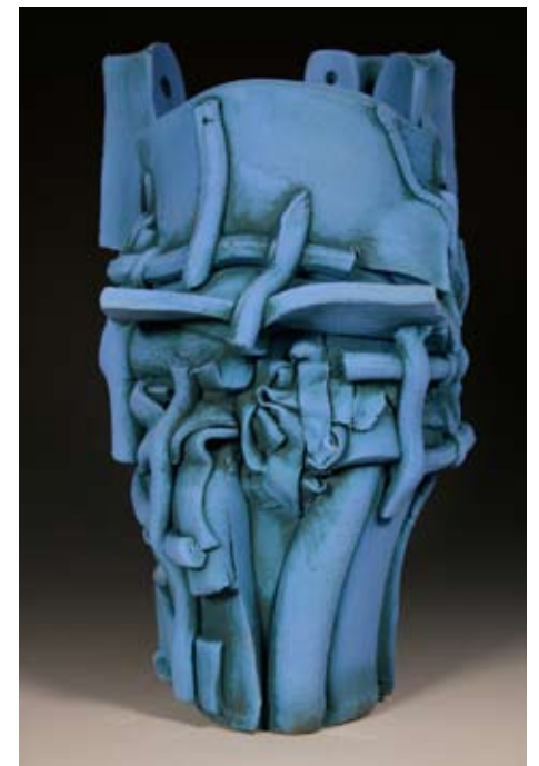
Texas. Feats of Clay takes place from April 24 through May 30 in Lincoln, California.

The National Drawing and Small Sculpture Show will be held from April 9 - May 7 at the Joseph A. Cain Memorial Gallery in Corpus Christi,