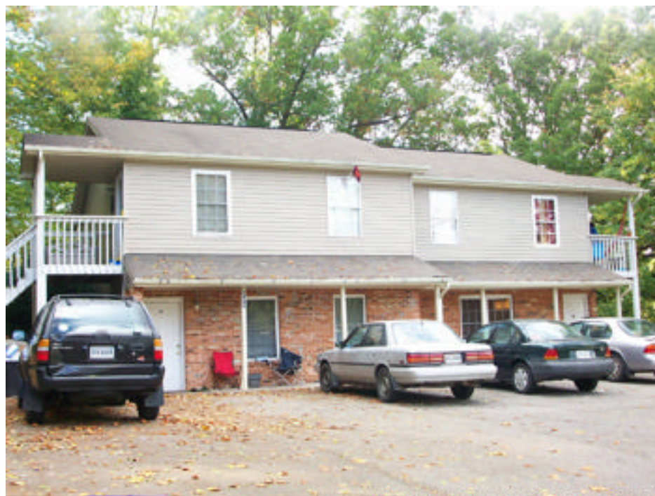
Nolen's Hill apartments--the location of the Oct. 11, Sunday morning shooting incident.