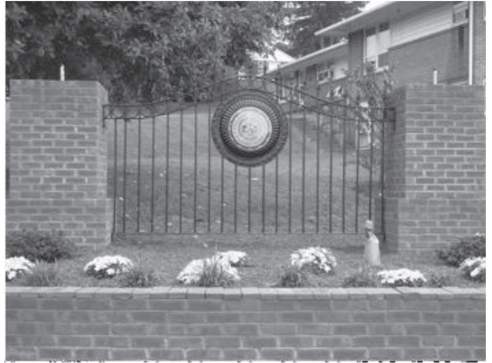
New Welcome sign with landscaping is located on the corner of Route 40 and Ferrum Mountain Road.

Along with the new sign, John Wesley Hall has also been under construction during the past few weeks. John Wesley Hall is the oldest building on campus, dating back to 1914, where it served as a men's residence hall until the 1960s.