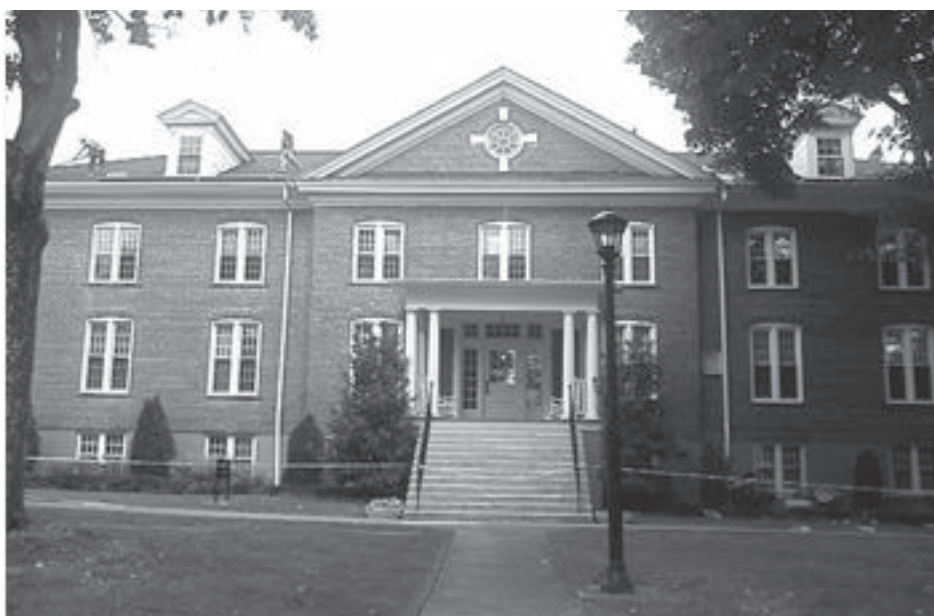
John Wesley Hall, the administration building, having its roof repaired.