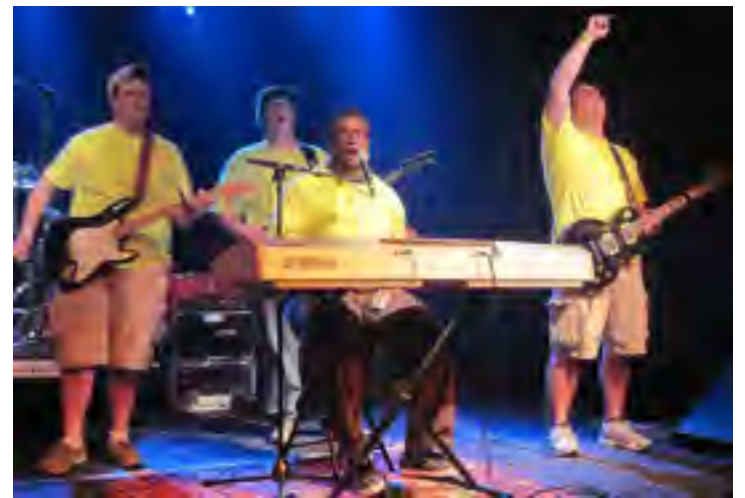
Above, Ferrum College's Praise Band, Ekklesia, performs and gets the crowd ready for Sanctus Real (below).

There was music and more music, hours of play.