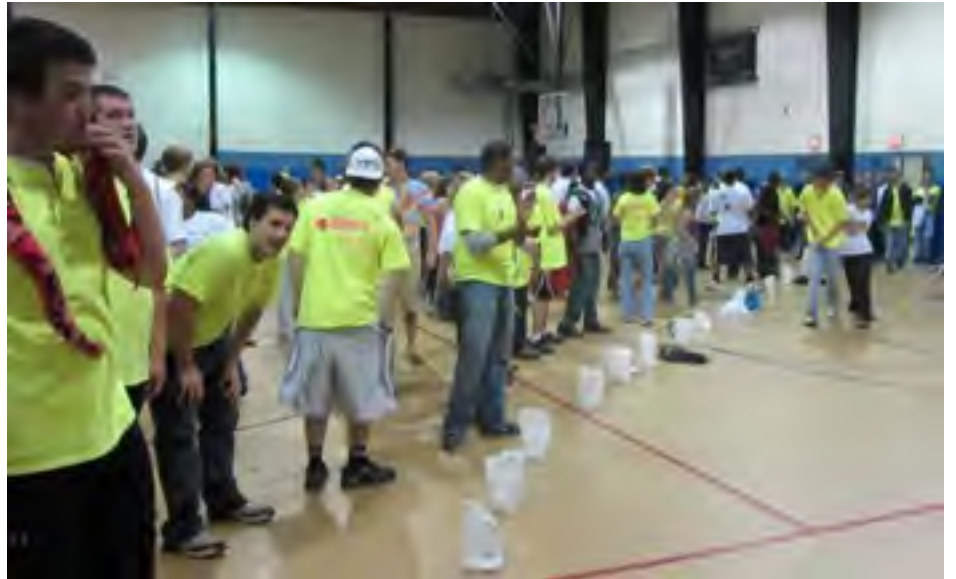
A crowd lined up to do Zumba.