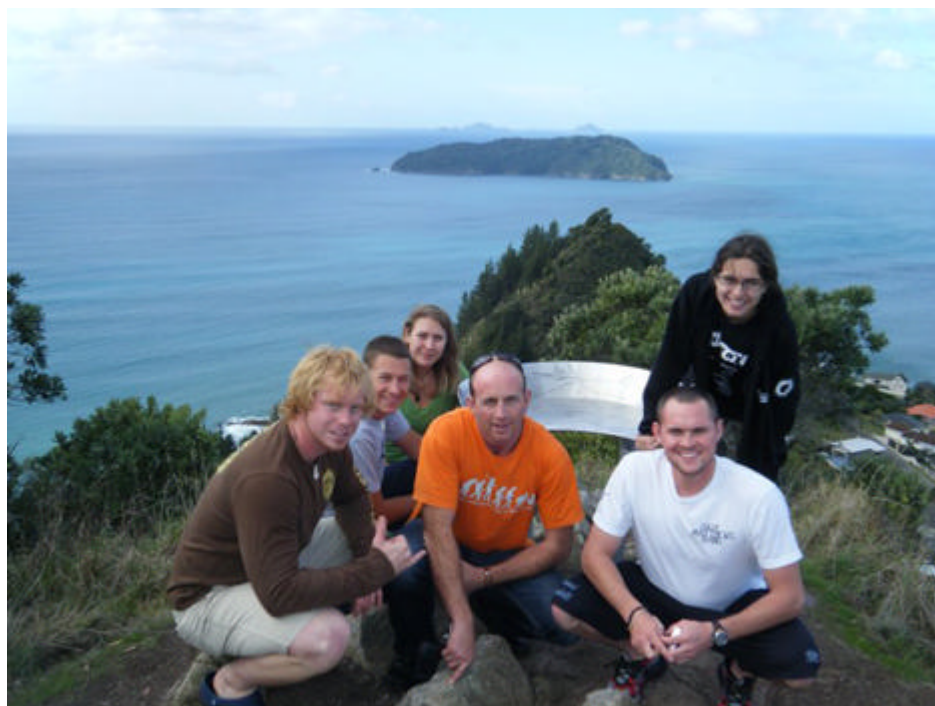
New Zealand was the destination for the 2010 recreation e-term.